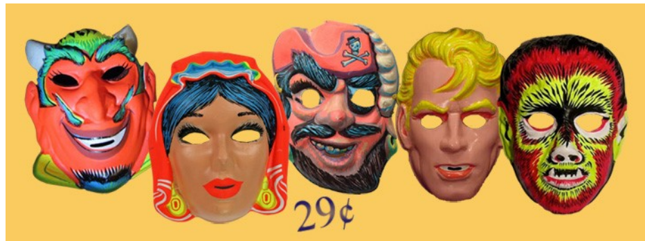
front of postcard